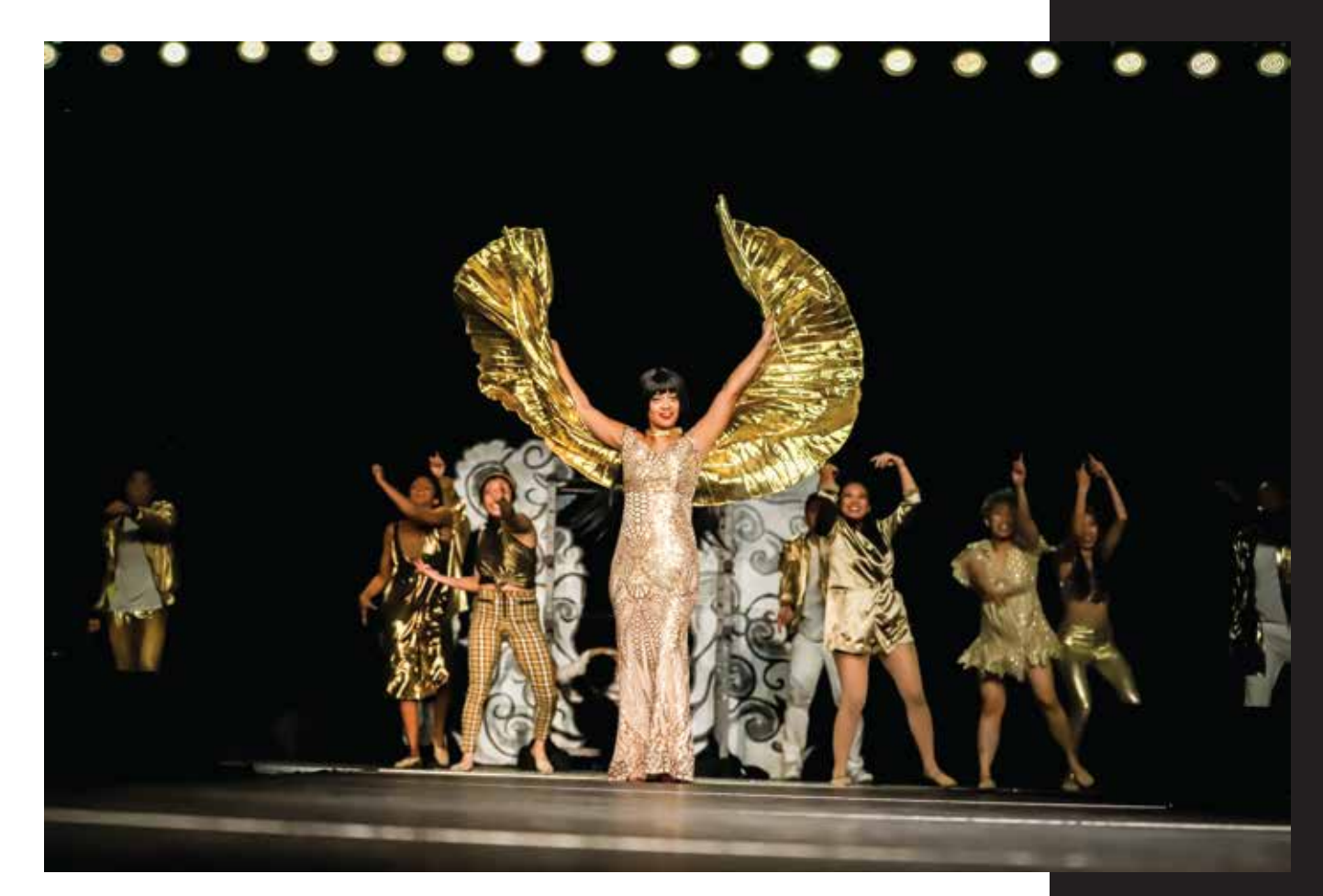
Across the Multiverse (Anime Los Angeles '20)