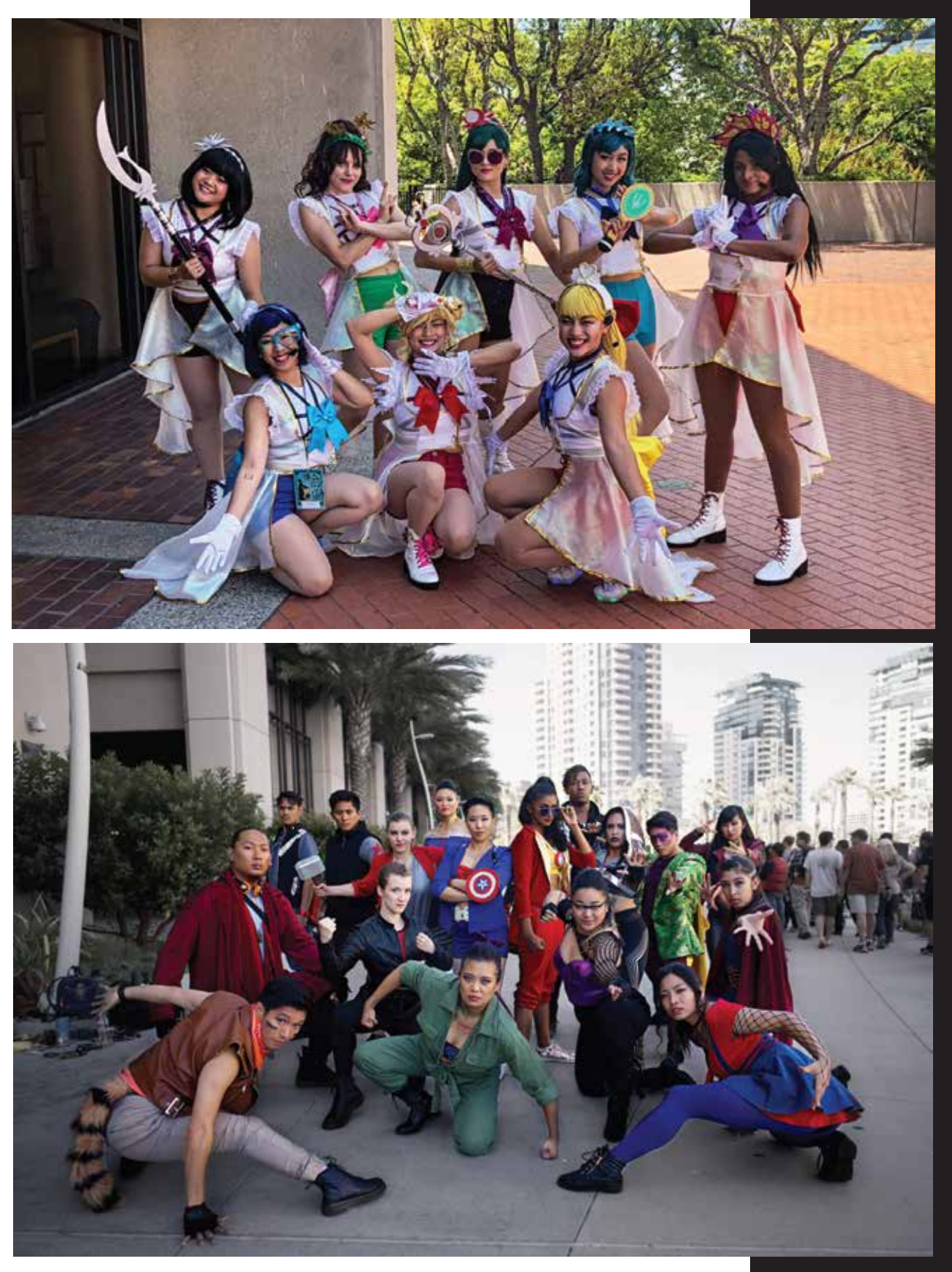
Idol Scouts (Ronin Expo '18)

Disney Suckerpunch (San Diego Comic Con '18)