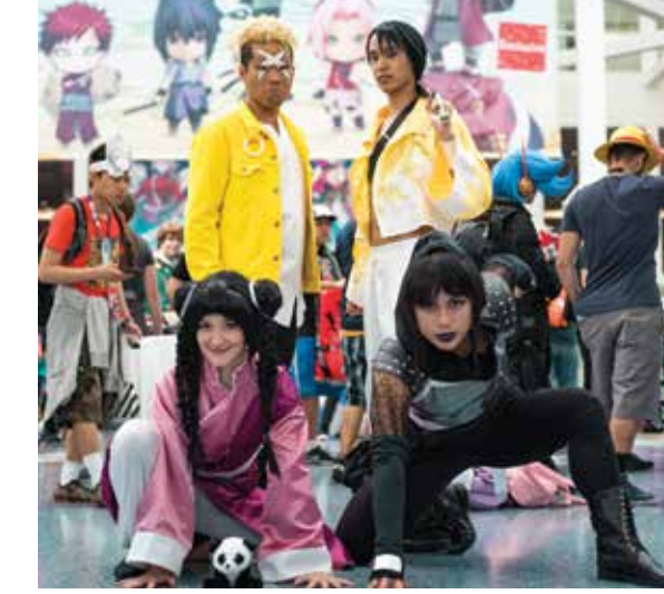
Soy Sox

Battle of the Houses (Los Angeles Comic Con '18)